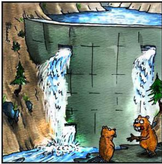
"Sure, it's nice, son, but even humans can build a decent dam with concrete."